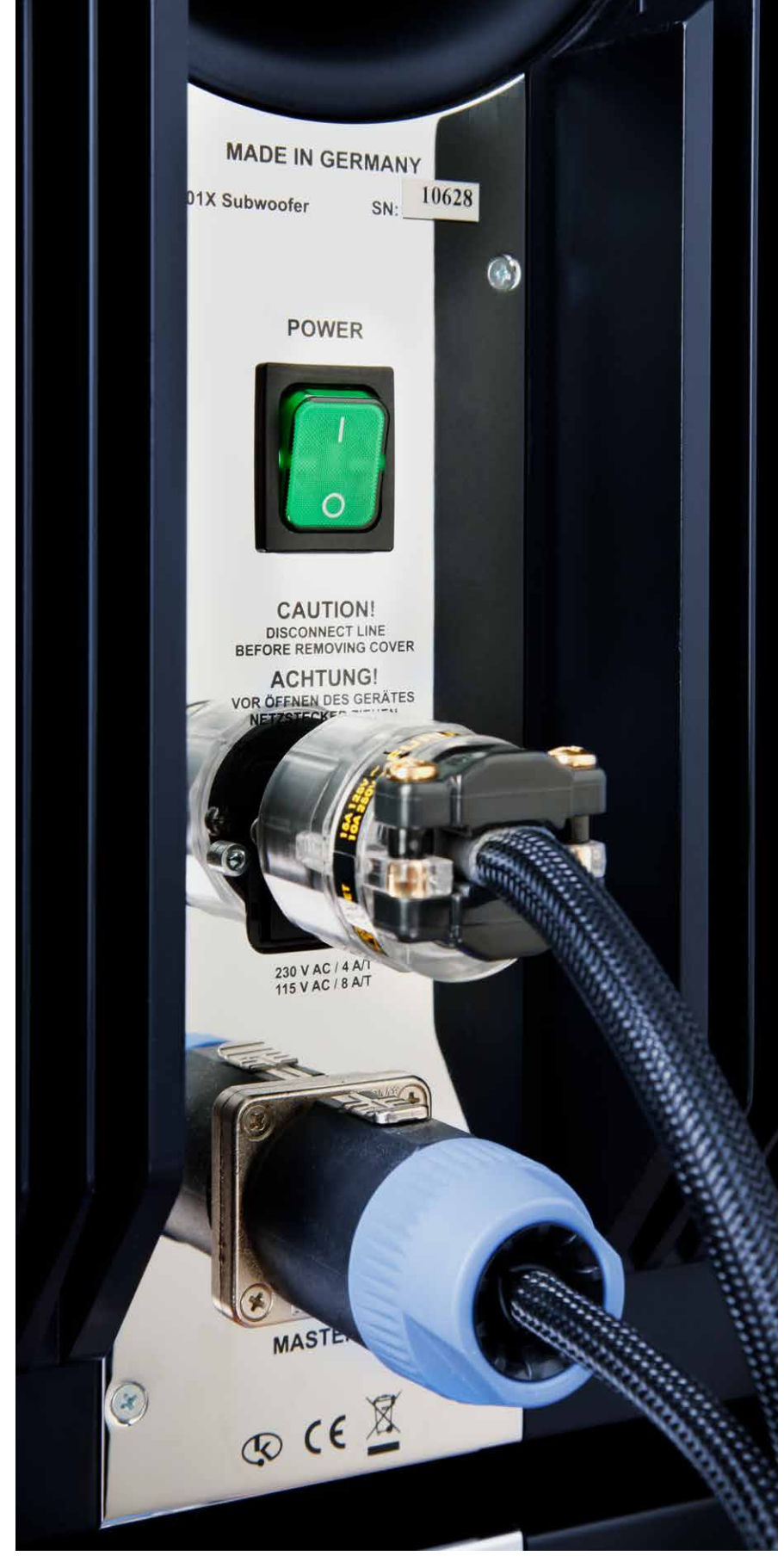
Subwoofer power amplifier with umbilical cord.