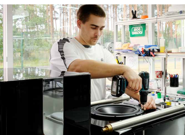
Construction of a push-push subwoofer cabinet.