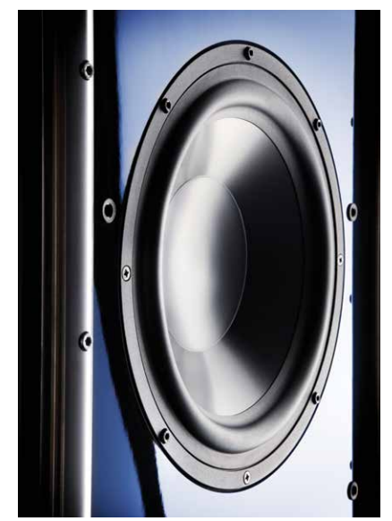
The twin-layered 12" aluminum membrane subwoofer driver, one of twelve in an X-Treme system.

Omnis in general (and the 101 X's par excellence) deal with room modes in an entirely different, rather more "generalized" and purely acoustic way—by flooding the entire listening space with full-range sound, coming (because the speakers radiate omnidirectionally both horizontally and vertically) from a nearly infinite number of different elevations and a nearly infinite number of