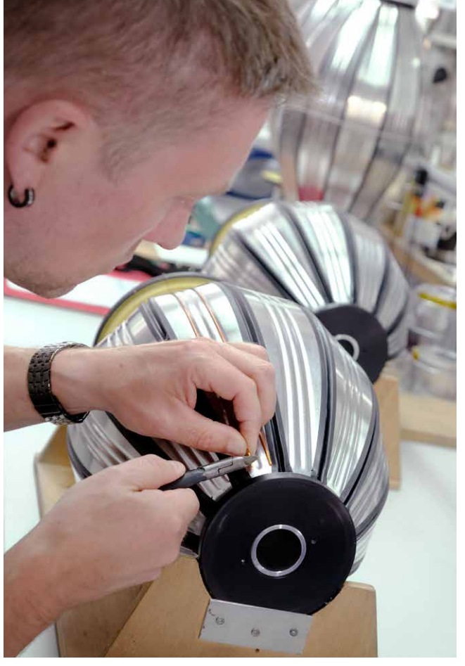
Attaching structural copper rods to the woofer.