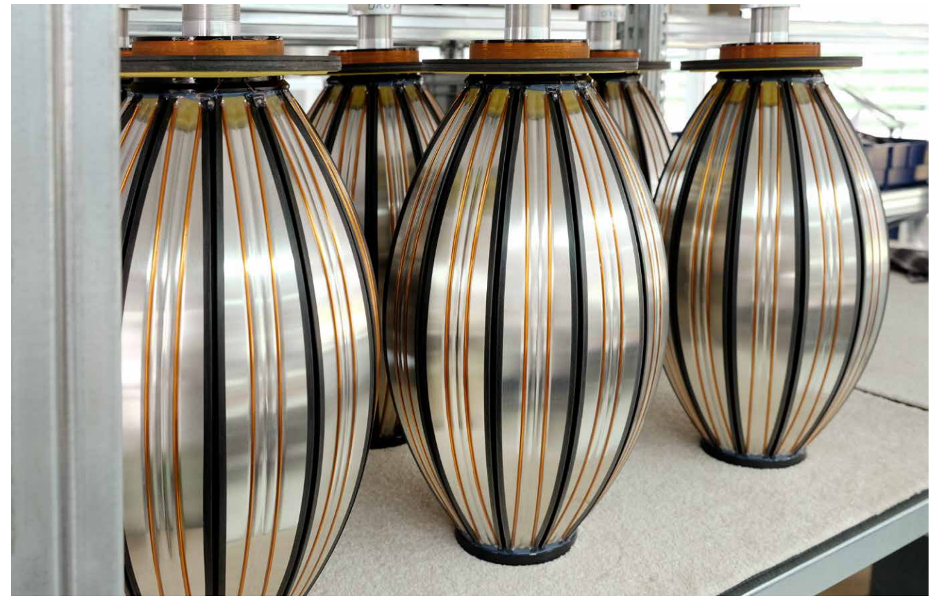
Completed Radiastrahler woofers waiting to be mounted.