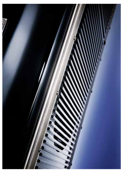
Detail of the X-Treme's subwoofer cabinet and grille, with solid stainless steel exoskeleton.