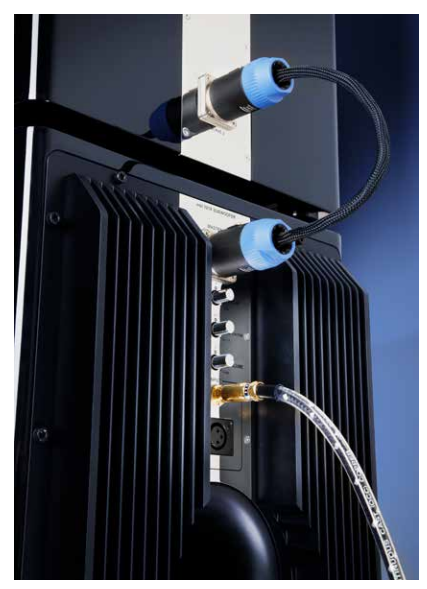
The X-Treme's master subwoofer control center, one for each channel.